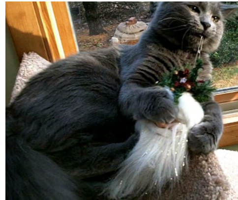
Mr Fluffypants Quint, 2015